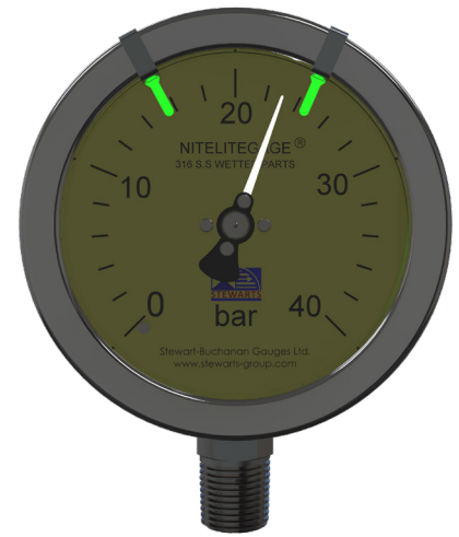
At Night Reflective Mode With Flashlight