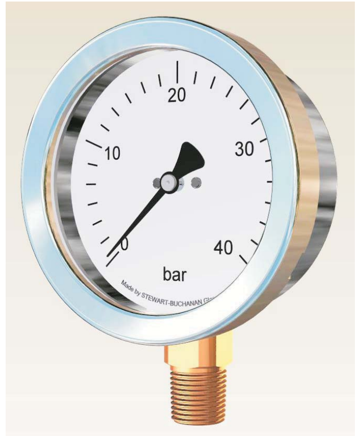
Model - 522

AISI 316 Stainless steel case. White plastic dial (Black Printing). Micro adjustable pointer / Black Finish. Other pressure connections (including high pressure). Laminated safety glass / Perspex window. Customer logo. Liquid filling. Vibragauge® Snubbagauge® Further options: on request