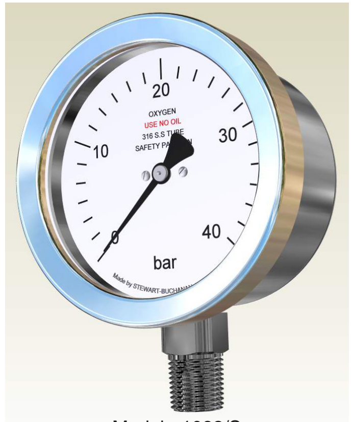
Model - 1082/S

State:- Pressure gauge model /Nominal size / Scale range / Size and location of connection / Optional extras reqd.